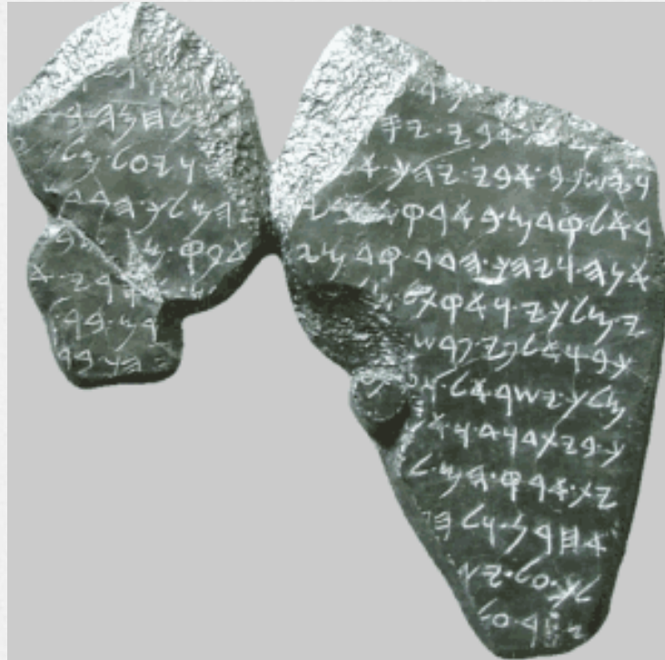
House of David inscription