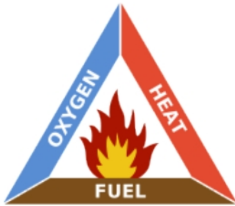
THE FIRE TRIANGLE