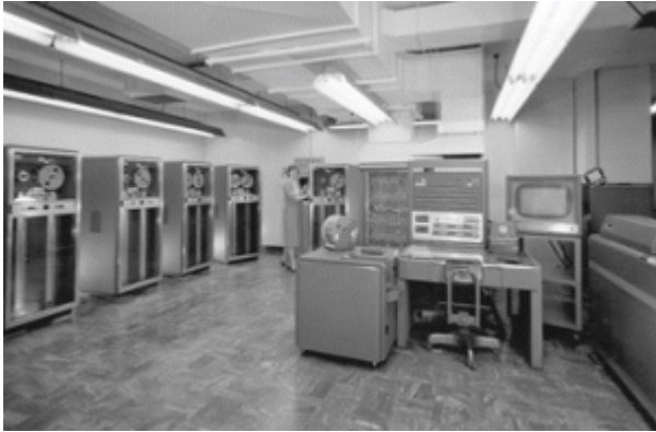
IBM 704 Mainframe

Now that we have explored the different components of information systems, we need to turn our attention to the role that information systems play in an organization. So far we have looked at what the components of an information system are, but what do these components actually do for an organization? From our definitions above, we see that these components collect, store, organize, and distribute data throughout the organization. In fact, we might say that one of the roles of information systems is to take data and turn it into information, and then transform that into organizational knowledge. As technology has developed, this role has evolved into the backbone of the organization. To get a full appreciation of the role information systems play, we will review how they have changed over the years.