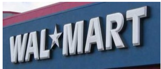
Registered trademark of Wal-Mart Stores, Inc.

Today, Walmart continues to innovate with information technology. Using its tremendous market presence, any technology that Walmart requires its suppliers to implement immediately becomes a business standard.